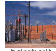
National Renewable Energy Laboratory