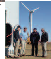
Basin Electric Power Cooperative