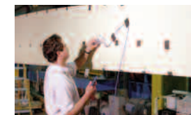
National Renewable Energy Laboratory