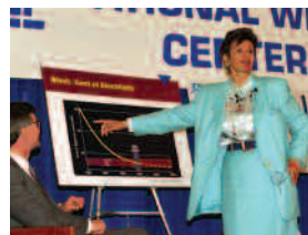
National Renewable Energy Laboratory