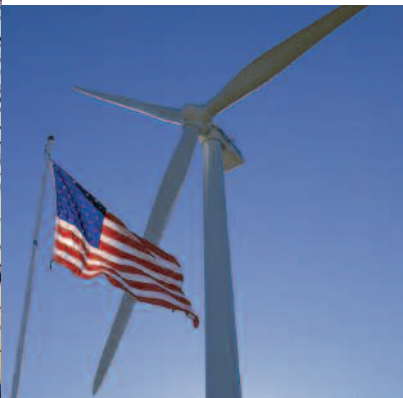
National Renewable Energy Laboratory

UWIG has expanded its technical outreach, offering members five user groups.